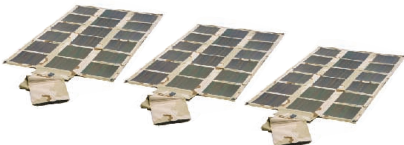
55 Watt + 55 Watt + 55 Watt