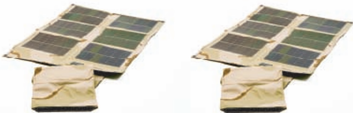
15 Watt + 15 Watt