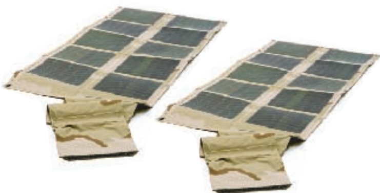
30 Watt + 30 Watt